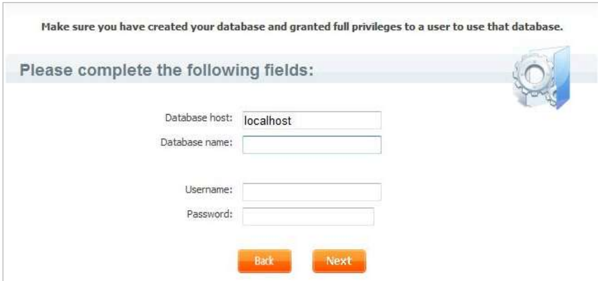
fig 2. Database Information