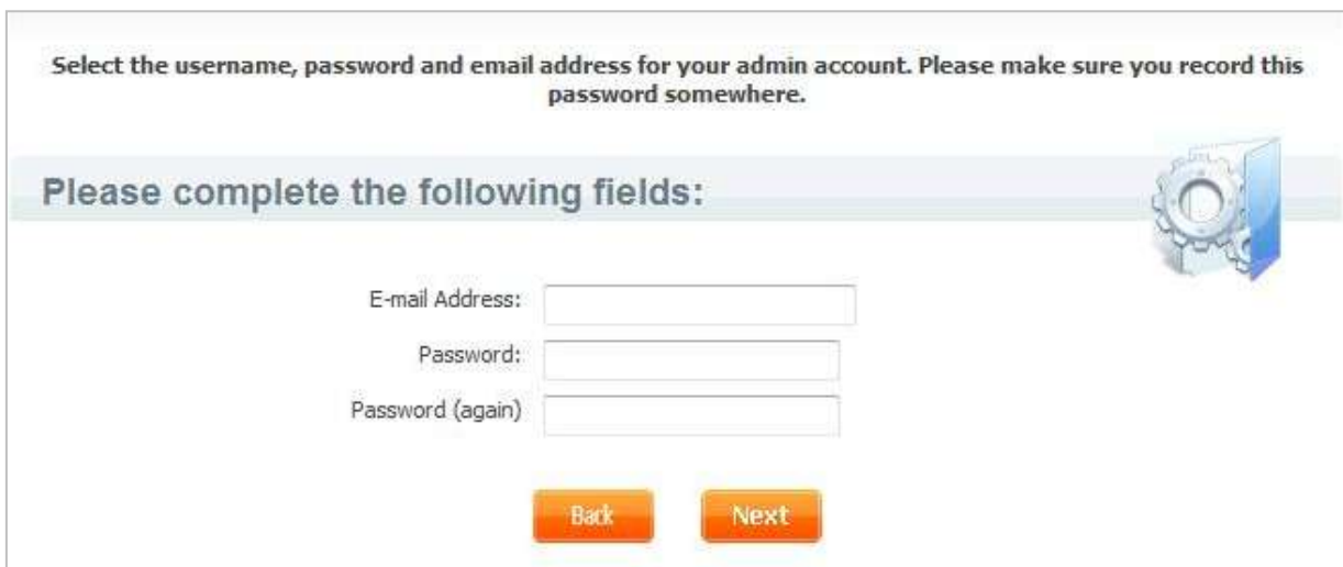
fig 3. Admin Account Information

On this page you will have to set up General Site Configuration – you should choose the login, email address and password for your Administration Panel: